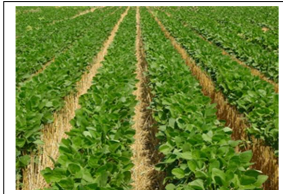
Fig. 4b: No-till soybeans grown in harvested