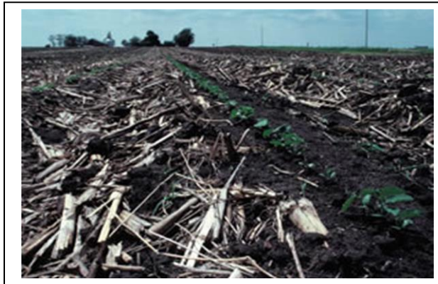
Fig. 4a: Newly planted soybeans in maize residue

improve soil productivity due to mulching effects that reduce runoffs and erosion, reduce soil evaporation and hence soil desiccation, and increases soil organic matter content.